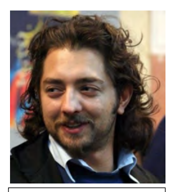
Photograph 1. An example of a person (internet).

The word Pictologics is made up of three parts: picto , logic , and s . let's begin with picto which is the short form of picture. This has two meanings: as a noun, it means pictures of different subjects such as people, nature, animals, food, signs of technology, different places, etc. Totally, there are just 300 pictures that are used for all levels. Most of these pictures, including the ones used in this article, were chosen either from the Internet public domain, permitted by the owner, or else photographed by the author. 'Picture', as a verb, means to 'visualize' or to 'imagine'. Via imagination, we can travel in time and place. What we do in the classes is, first of all, to teach the language learners how to